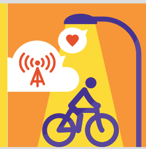
9. Smart Array: Intelligent Street Poles as a Platform for Urban Sensing