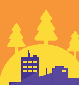
3. Adopt a Tree through Your Social Network