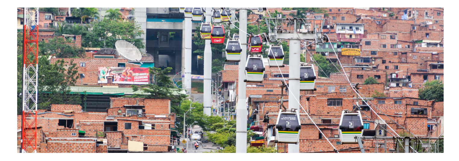
Picture 8. Medellín's Metrocable was designed to improve transport and quality of life in informal settlements located on the mountainside, home to some of the city's most disadvantaged communities.

http://www.one.org/international/blog/why-residents-of-kibera-slum-are-rejecting-new-housing-plans