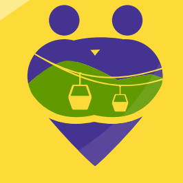
8. Medellin Revisited: Infrastructure for Social Integration