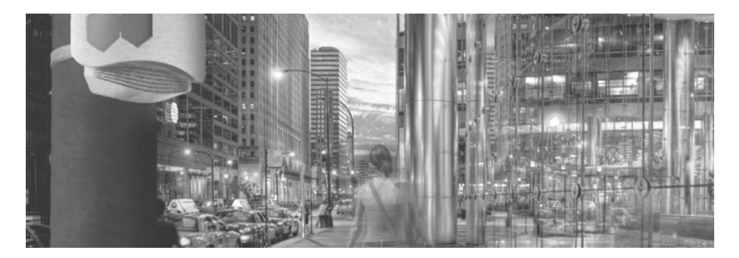
Picture 9. The Array of Things (AoT) is an urban sensing project, a network of interactive, modular sensor boxes that will be installed around Chicago to collect real-time data on the city's environment, infrastructure, and activity for research and public use. AoT will essentially serve as a "fitness tracker" for the city, measuring factors that impact liveability in Chicago such as climate, air quality and noise.

www.sensity.com https://arrayofthings.github.io