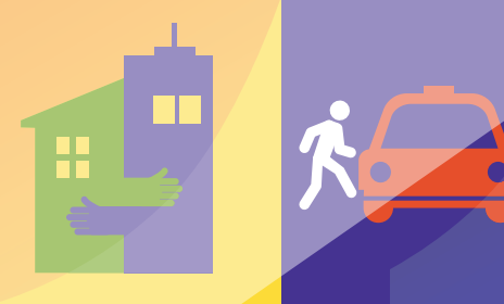
6. The Sharing City: Unleashing Spare Capacity