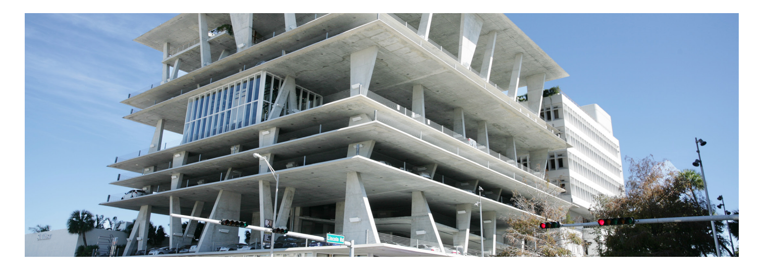
Picture 1 . A multi-storey car park in Miami Beach also plays host to parties, yoga classes and weddings. The concrete building with floor slabs supported on wedge-shaped columns was completed in 2010 to offer naturally lit parking levels that can also be used for other activities above a row of shops and restaurants.

http://www.melbourne.vic.gov.au/ParksandActivities/Parks/ Pages/ErrolStreet.aspx https://www.melbourne.vic.gov.au/AboutMelbourne/ Statistics/Documents/TransformingCitiesMay2010.pdf